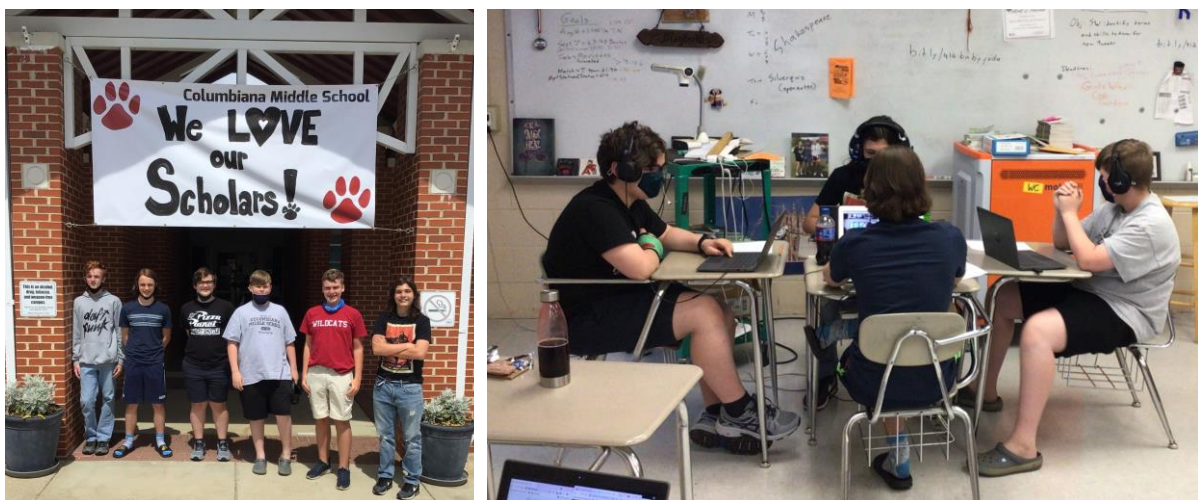
The team from Columbiana Middle School, (l) shown standing under a banner made by their classmates, and (r) competing from their school on the day of the tournament.

With the tournaments being held online, it offered the unique opportunity for volunteers outside of Alabama to assist. There were volunteers who ran their live game rooms from California, Massachusetts, and Tennessee.