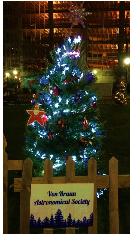
The VBAS Tinsel Trail tree