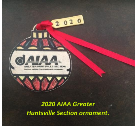
2020 AIAA Greater Huntsville Section ornament.