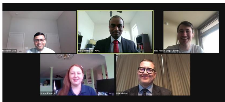
AIAA Greater Huntsville Section members meeting with various congressional offices

AIAA Public Policy Committee (PPC) put together multiple trainings and provided relevant material so that all the members are well prepared to engage with congressional offices.