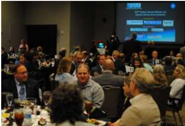
Before the Dinner