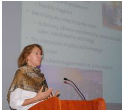
AIAA Executive Director Dr. Magnus speaking

The invited speaker for the evening was AIAA Executive Director Dr. Sandra H. Magnus. She discussed the role of the Institute and its benefits. Dr. Magnus flew in space on the STS-112 shuttle mission in 2002, and on the final shuttle flight, STS-135, in 2011. She also served for four and one-half months as flight engineer and science officer on the International Space Station's Expedition 18 crew.