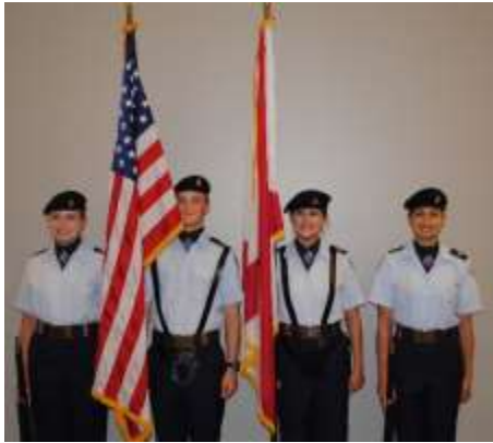
Bob Jones High School AFJROTC Color Guard